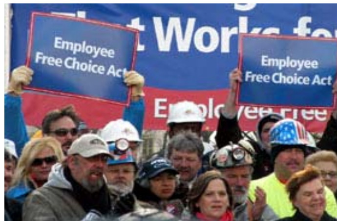
2009 Employee Free Choice Act Rally on Capitol Hill